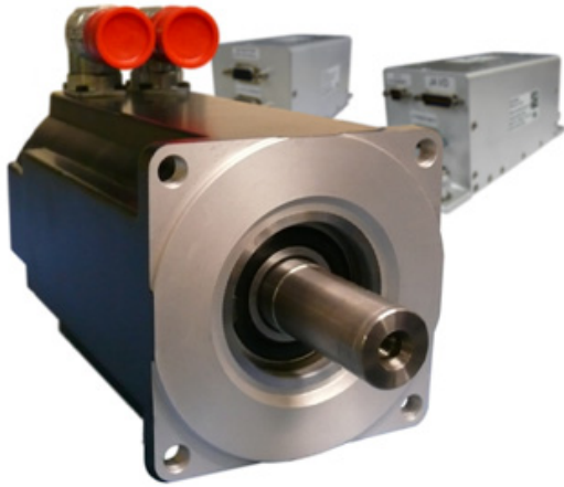
Figure 2 - SensINTNet Product

A single Controller Module (CM) supports one or multiple motor Drive Modules (DMs).